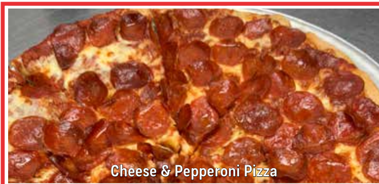
Cheese & Pepperoni Pizza