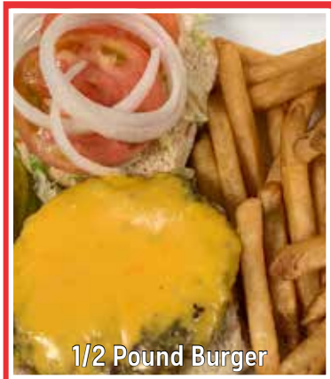
1/2 Pound Burger