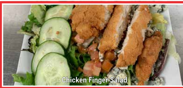
Chicken Finger Salad