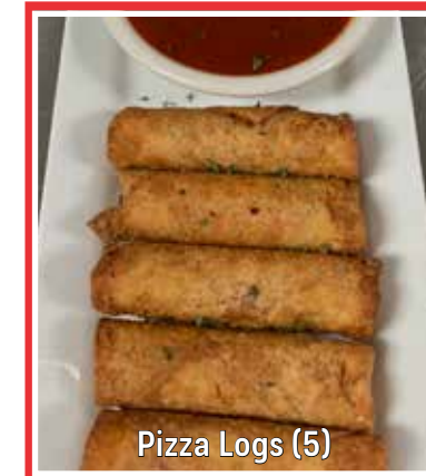
Pizza Logs (5)