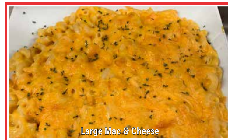
Large Mac & Cheese