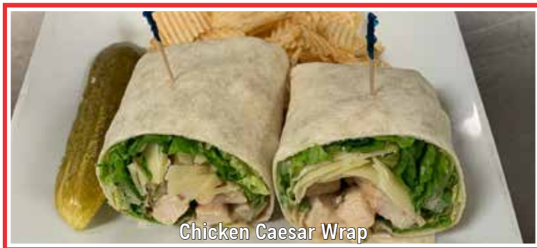
Chicken Caesar Wrap