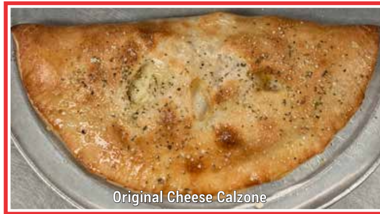
Original Cheese Calzone

Tomato • Spinach • Mushrooms • Broccoli • Banana Pepper Rings Jalapeños • Roasted Red Peppers • Green Peppers Sweet Peppers • Black Olives • Green Olives • Artichokes Pineapple • Onion • Sautéed Onions • Pepperoni • Steak • Bacon Meatballs • Sausage • Ham • Grilled Chicken Chicken Fingers • Extra Cheese (Mozzarella or Cheddar) Extra Side of Sauce 0.99 Extra Cheese (Mozzarella, Cheddar, or Ricotta) 0.99 Additional Ingredients 0.99